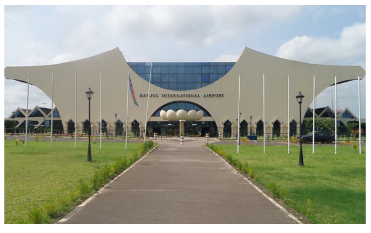
Banjul International Airport