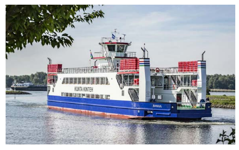
THE KUNTA KINTEH FERRY THAT TRANSPORTS GOODS AND PASSENGERS FROM BANJUL TO BARRA